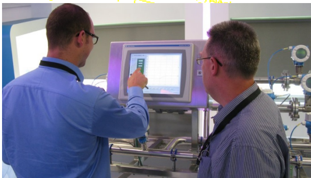
Flow controller tuning and performance

The modules are designed to be taken in series to provide a structured but flexible route to competence. The basic course can be bypassed for those with a good basic understanding of PID control and terminology. The advanced tuning course and/or the control implementation courses can be taken individually, or can be combined for those that need to develop both implementation and tuning skills. All modules incorporate significant practical content using both simulation and real processes.